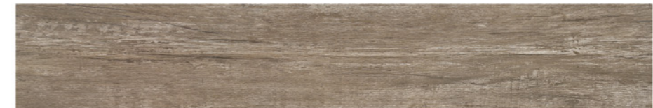
BNM8505K 20x120CM 8"x48"