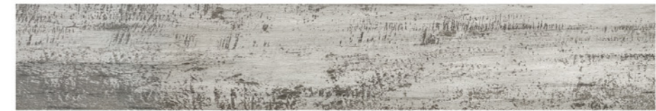
BNM7505K 20x120CM 8"x48"