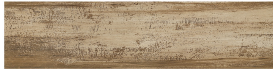
BNM3505K 30x120CM 12"x48"