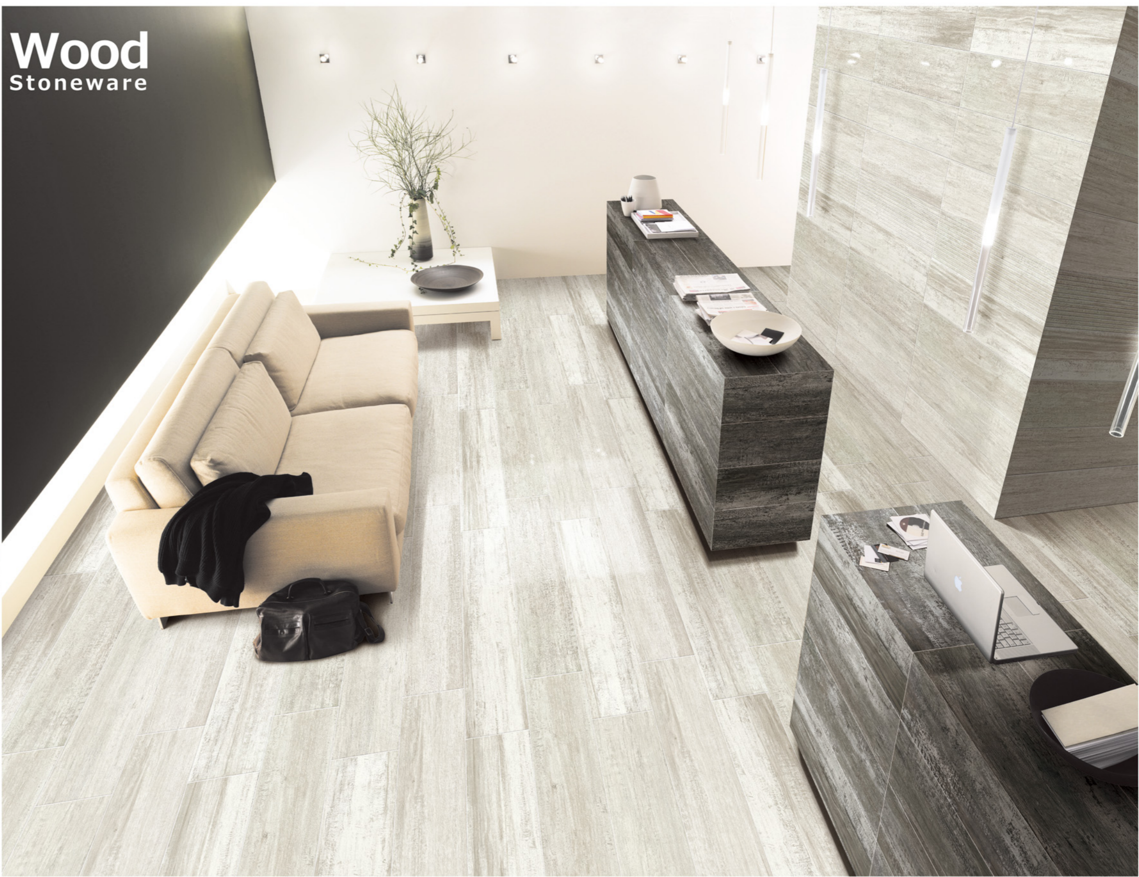
BNM1505K 30x120CM 12"x48"