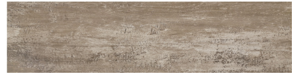
BNM8505K 30x120CM 12"x48"