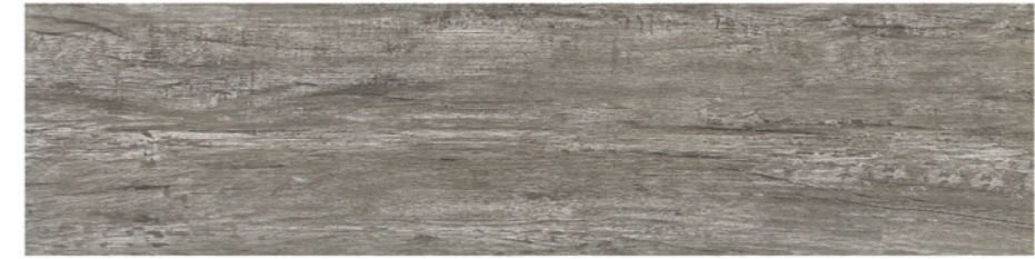
BNM7505K 30x120CM 12"x48"