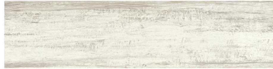
BNM1505K 30x120CM 12"x48"