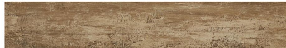
BNM3505K 20x120CM 8"x48"