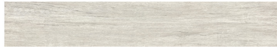
BNM1505K 20x120CM 8"x48"