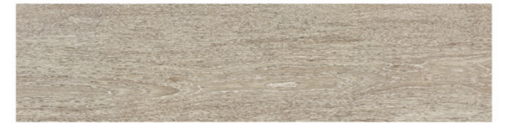
HNM8409K Size: 300mmx1200mm