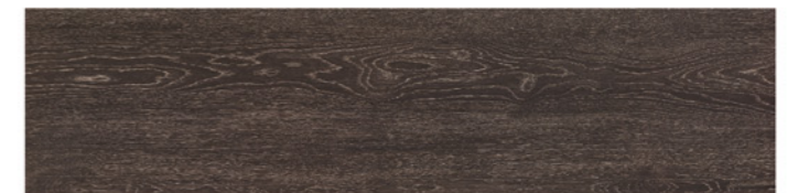
HNM7509K Size: 300mmx1200mm