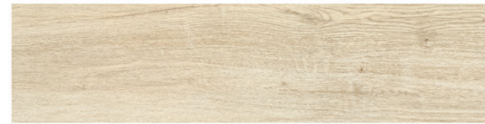
BNM1408K Size: 300mmx1200mm

Habita series, contains the original ecological atmosphere and comfort, belonging to Bode porcelain flooring. Using Bode original six original ecological imaging technology, realistic reduction in the world of wood textures, create visual space treasure timber. Meanwhile across the wooden floor decoration limitation: fire anti-moth, low water absorption, dry and breathable, slip resistant, perfect to restore the natural lifestyle. Full cast and combines the advantages of tile glaze bright feature, is a perfect new environmentally friendly products in line with the concept of a comfortable and healthy life.