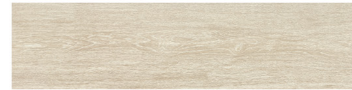
HNM1509K Size: 300mmx1200mm

Timber tech, which are 120CM long and come in lots of choices of widths 60,30,20 and 15CM. Timber tech series porcelain tiles, doesn't just cover a space. They define it.