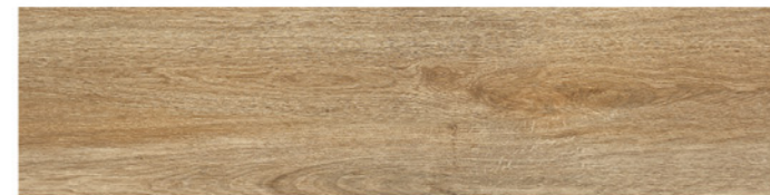
BNM3408K Size: 300mmx1200mm