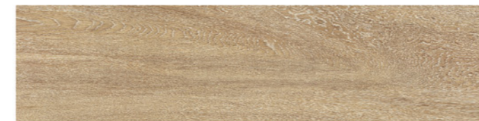
HNM2409K Size: 300mmx1200mm