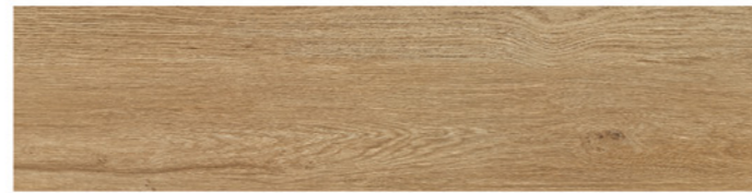
BNM2408K Size: 300mmx1200mm