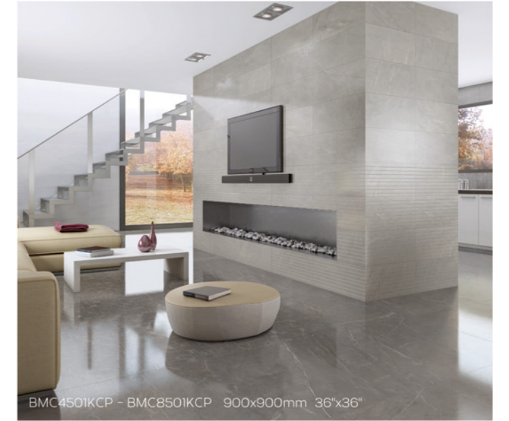
BMC4501KCP - BMC8501KCP 900x900mm 36"x36"