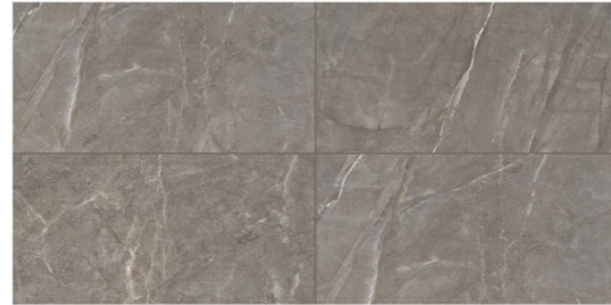
BMC4501K (MATT) BMC4501KCP (LAPPATO) Size:900x450mm 36"x18"