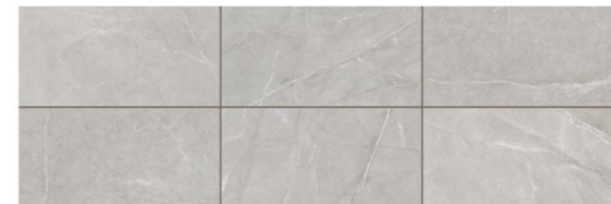
BMC8501K (MATT) BMC8501KCP (LAPPATO) Size:600x300mm 24"x12"