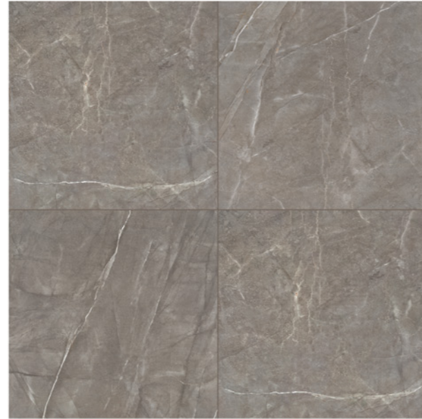
BMC4501K (MATT) BMC4501KCP (LAPPATO) Size:900x900mm 36"x36"