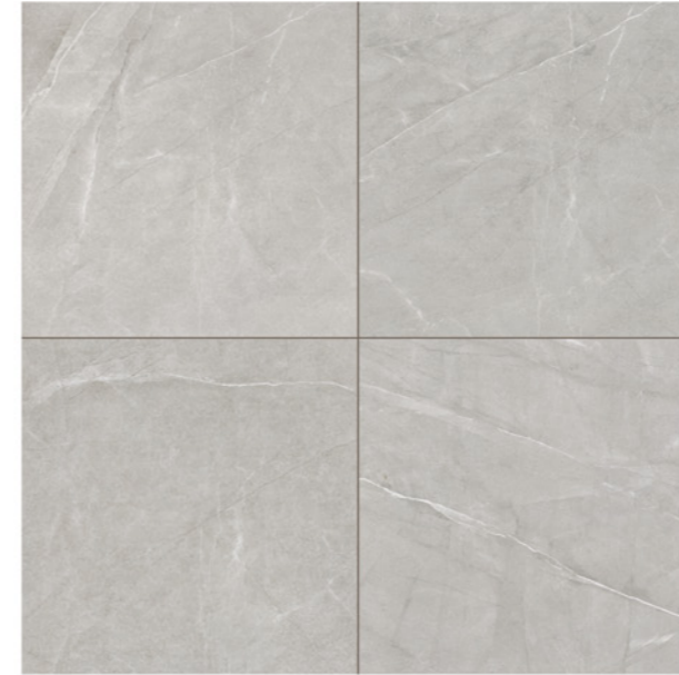
BMC8501K (MATT) BMC8501KCP (LAPPATO) Size:900x900mm 36"x36"