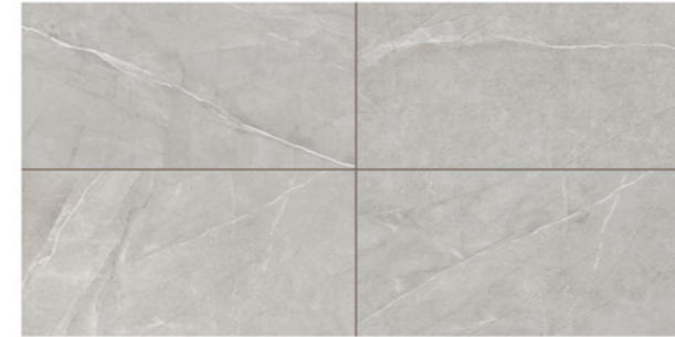
BMC8501K (MATT) BMC8501KCP (LAPPATO) Size:900x450mm 36"x18"