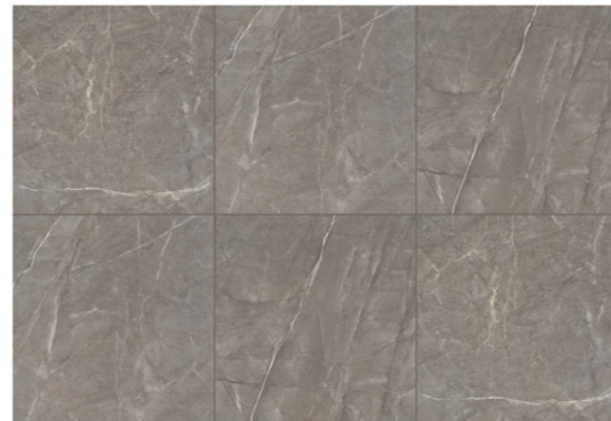
BMC4501K (MATT) BMC4501KCP (LAPPATO) Size:600x600mm 24"x24"