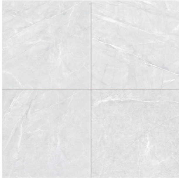
BMC3501K (MATT) BMC3501KCP (LAPPATO) Size:900x900mm 36"x36"