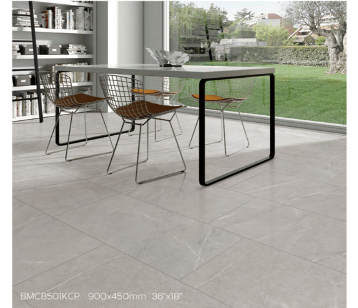
BMC8501KCP 900x450mm 36"x18"