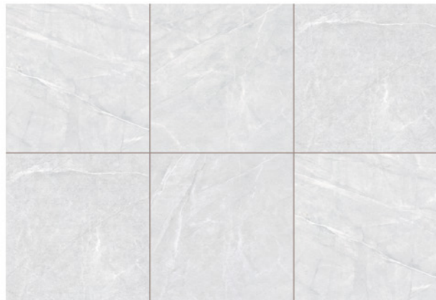
BMC3501K (MATT) BMC3501KCP (LAPPATO) Size:600x600mm 24"x24"