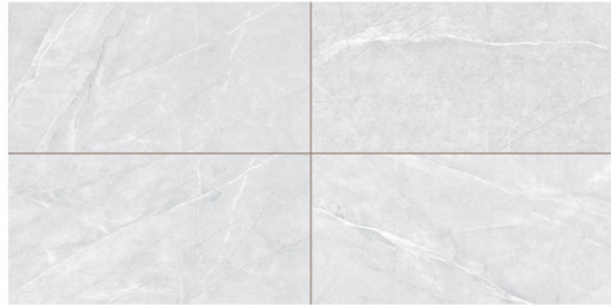
BMC3501K (MATT) BMC3501KCP (LAPPATO) Size:900x450mm 36"x18"