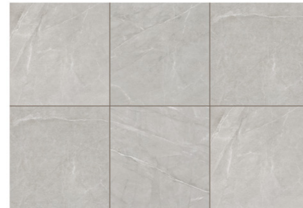
BMC8501K (MATT) BMC8501KCP (LAPPATO) Size:600x600mm 24"x24"